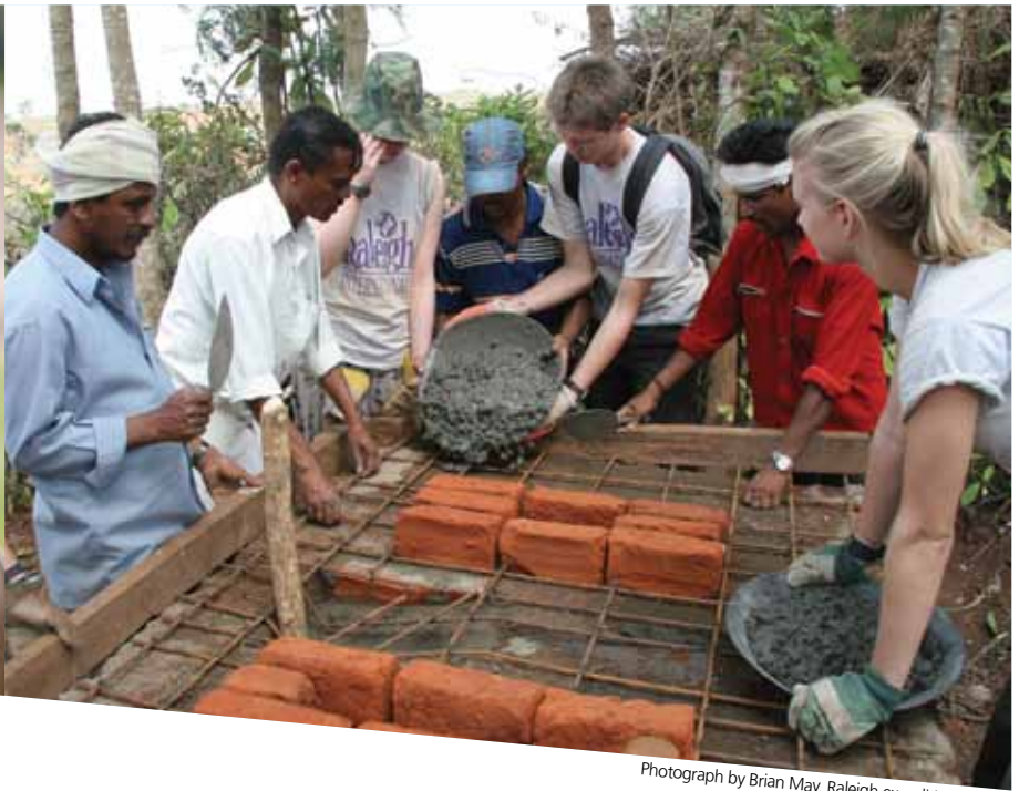
Raleigh expedition to India